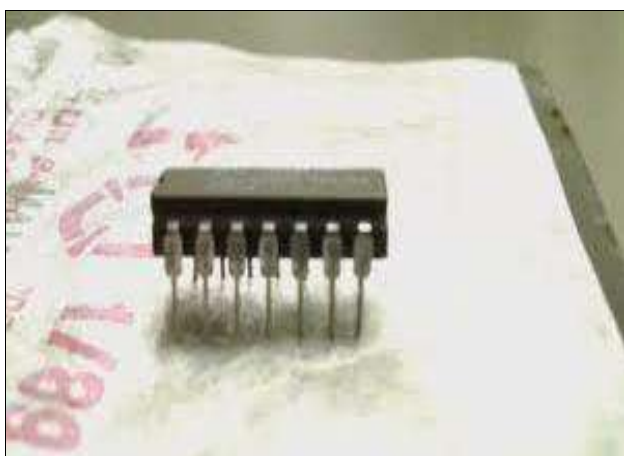
Fig 4: Digital