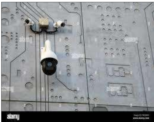
Fig 3: Machine selection