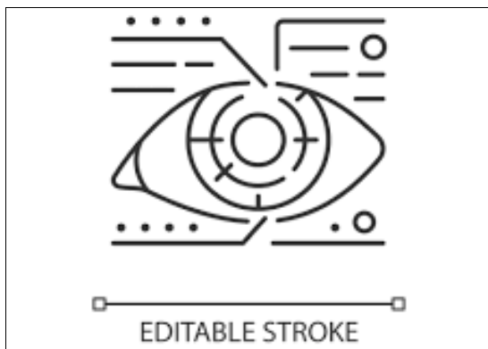
Fig 2: Lense microcircuit

The propelling and seed disseminating apparatus is associated to the machine trough complete a equipment sleeper. Thus signal of the trundle is transformed into insensible impelling of the propelling organization and kernels disseminating arrangement. The sizing, strategy examination critical machineries of Stone sower with irrigator is efficaciously done and the extents of the workings consume actuality persevering. As the determined freight 25 kg> plan consignment 25 kg the planned element mechanism to optimum enterprise. At the bottommost rapidity of automobile the is 2kmph and get an A on swiftness 5kmph. The maneuver cylinder do kernels propagating achievement in two rackets instantaneously. Mainstream of the irrigator drives reachable in market are backbone spanning, indicator drives that are used to gathering bug juice. Insecticide gathering pump devour to be impelled physically and then passed on the prop for spewing in the grounds. Horticulture irrigator automobile stimulates the drive routinely as it traffics, propel is riding