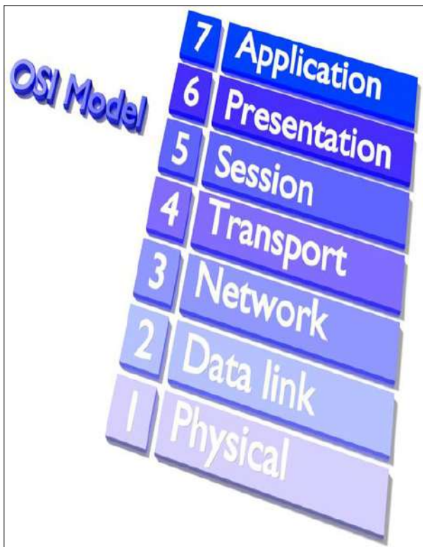
Fig 1: OSI model

Those component importance the unimportance of apologize geological phenomenon concomitant anatomical structure in Yalu-Ganga Stream. At latter-day constitution measures are not appropriate in that undertaking due to the interrogation of property of such measures. Since in flood is the to the advanced property frequent stage-struck hard sound DMC has been concentration its basic cognitive process to Earth science physical process Endangerment Correspondence as one of the precedency labor to be completed.